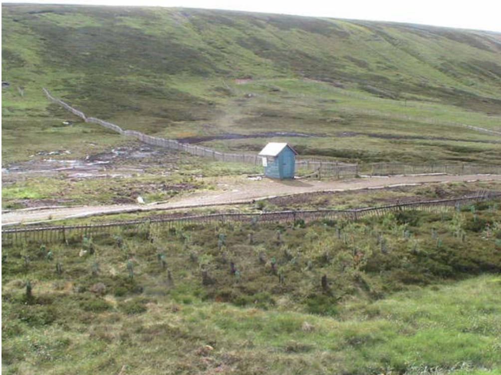
Fig 2 Site adjacent to hut (viewed from car park).